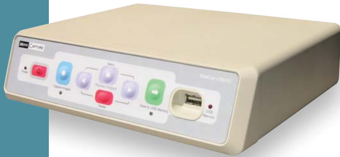
MediCap™ USB 100 Captures digital images from analog medical imaging devices

The MediCap USB100 easily captures digital images from medical imaging equipment such as ultrasounds, endoscopes, intraoral cameras, surgical microscopes, and most video imaging devices.