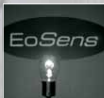
EoSens®-Dynamic Range Adjustment

All trademarks are properties of their respective owners. Mikrotron reserves the right of change without notice. Mikrotron is not liable for harm or damage incurred by information contained in this document.