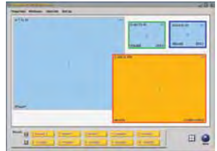
QuadView HDx Web Interface Operate the processor's display capabilities remotely from any web browser.