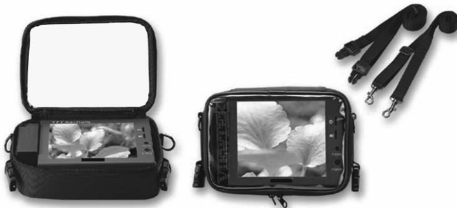
Field Version (LMP-681 Pictured)