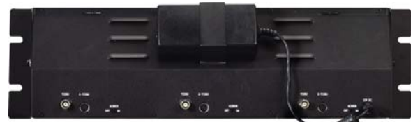
LM-563R Rear with PS Mounted