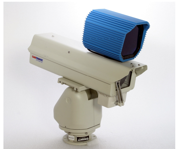
Night Vision Camera System for 100 & 200 meters (330ft & 660ft)