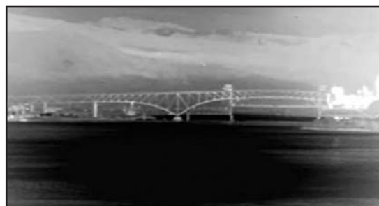
Showing highway bridge out 7.8 km using only TR4000 with 100mm lens